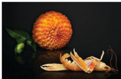
Photographer Agniet Snoep’s images were introduced at DC’s (e)merge art fair.

Leigh Conner of Connersmith ( connersmith.us.com ) gives us her picks for contemporary art’s rising superstars.